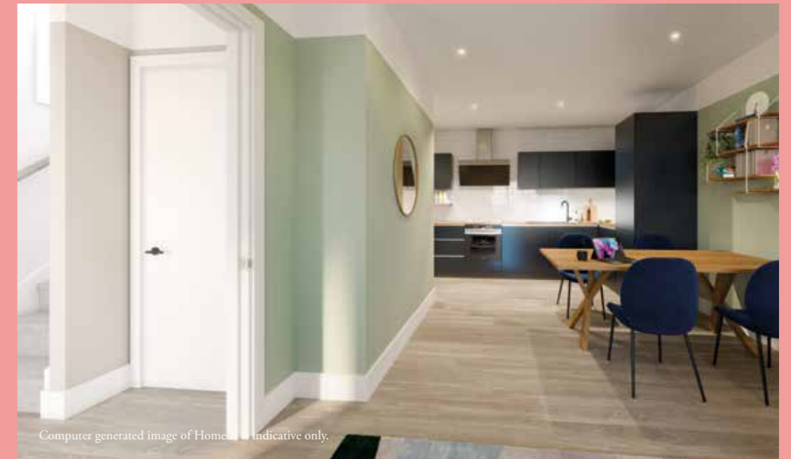
Computer generated image of Home X is indicative only.