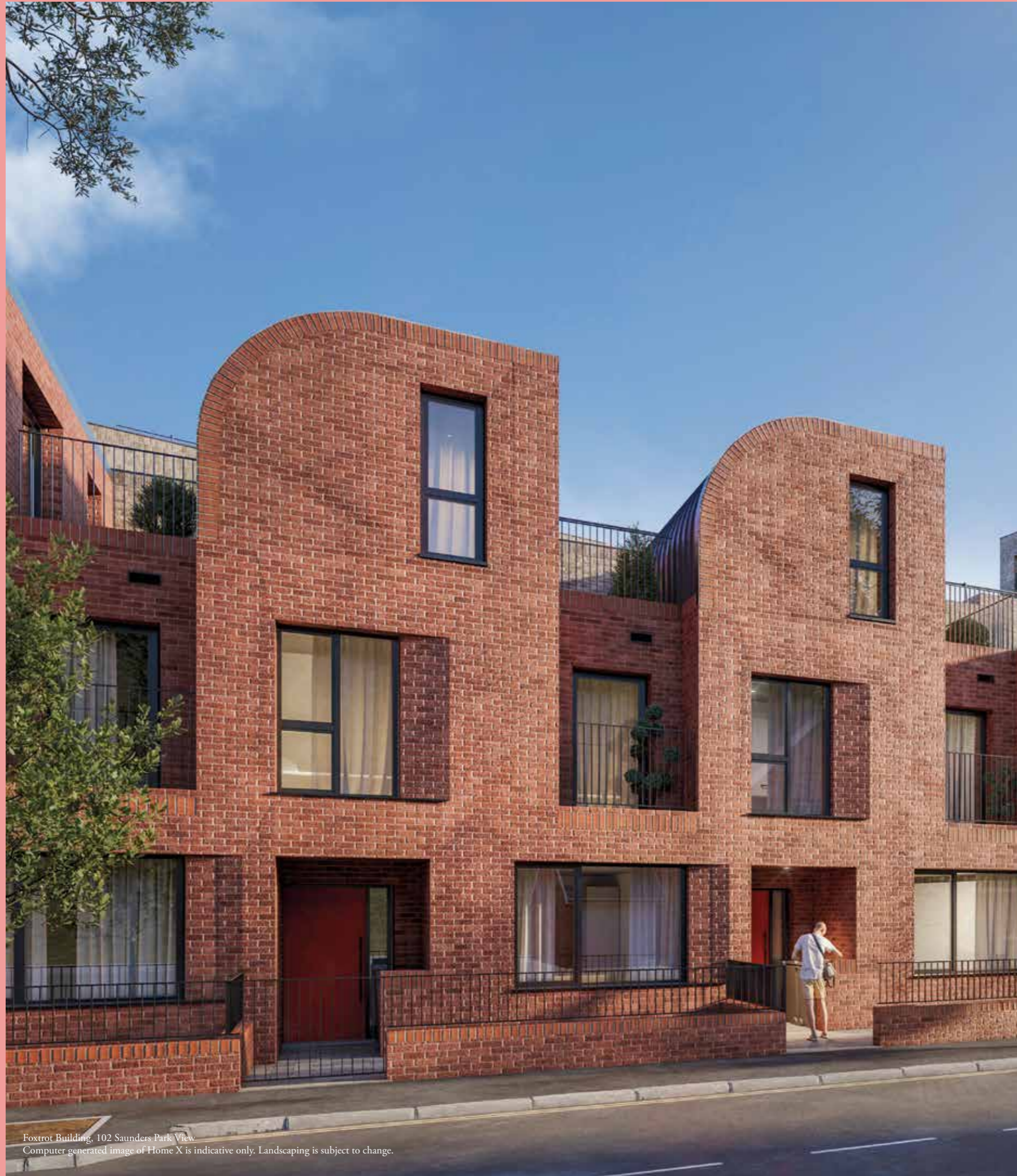
Fox Trot Building, 102 Saunders Park View Computer generated image of Home X is indicative only. Landscaping is subject to change.