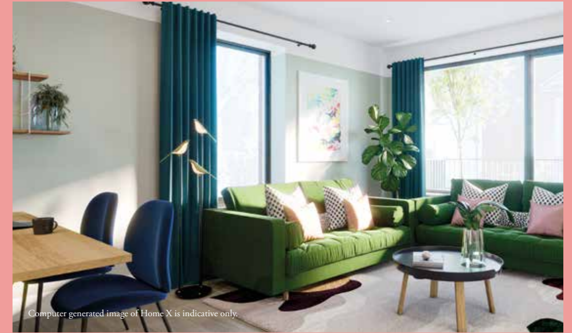
Computer generated image of Home X is indicative only.